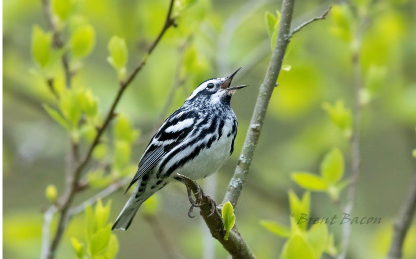
Black-and-white Warbler

To support this mission, Seven Mountains Audubon seeks to provide experiences, develop camaraderie, and share information to promote understanding and appreciation of wild birds and the ecosystems they inhabit.