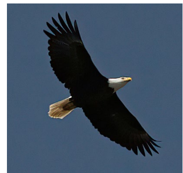
Bald Eagle