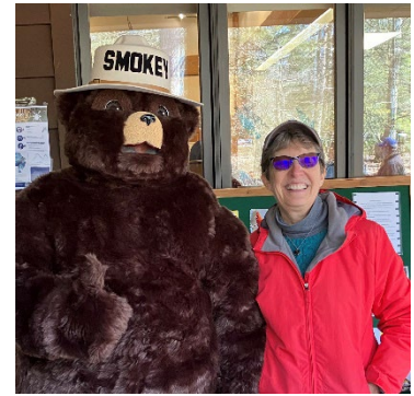
Board Member & Friend at Snow Fest