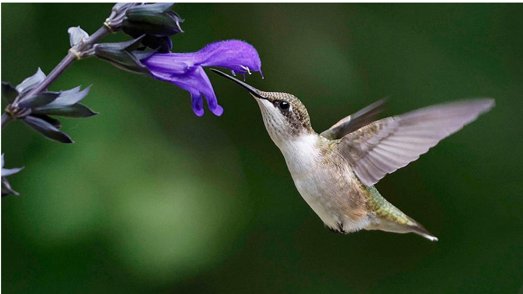
Ruby-throated hummingbird

The National Audubon Society protects birds and the places they need, today and tomorrow, throughout the Americas using science, advocacy, education, and on-the-ground conservation. To support this mission, Seven Mountains Audubon seeks to provide experiences, develop camaraderie, and share information to promote understanding and appreciation of wild birds and the ecosystems they inhabit.