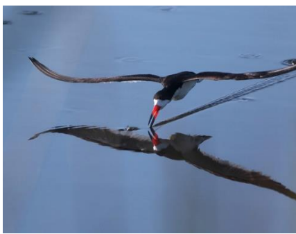
Black Skimmer