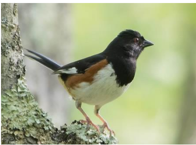
Eastern Towhee - Karen Houser

https://sevenmountainsaudubon.org/ https://www.facebook.com/groups/7mountains/