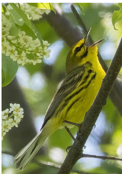
Prairie Warbler - Karen Houser

Please check our website , Facebook page , and the Daily Item for details, updates, and cancellations.