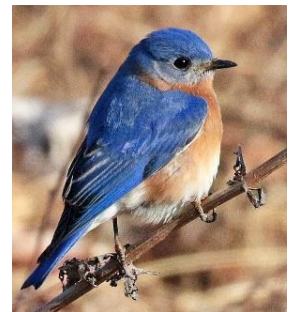
Eastern Bluebird