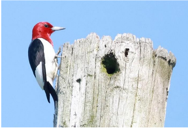
Red-headed Woodpecker