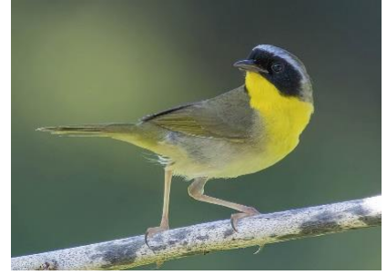
Common Yellowthroat

If you'd like someone to contact you when opportunities arise, please either reply to the email that brought you this newsletter or print and complete the BRIEF form below and mail it to the address at the bottom. Thanks—hope to see you!